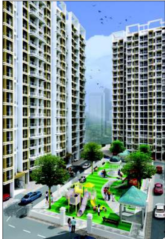
Nakshatra Greens, Naigaon (East)