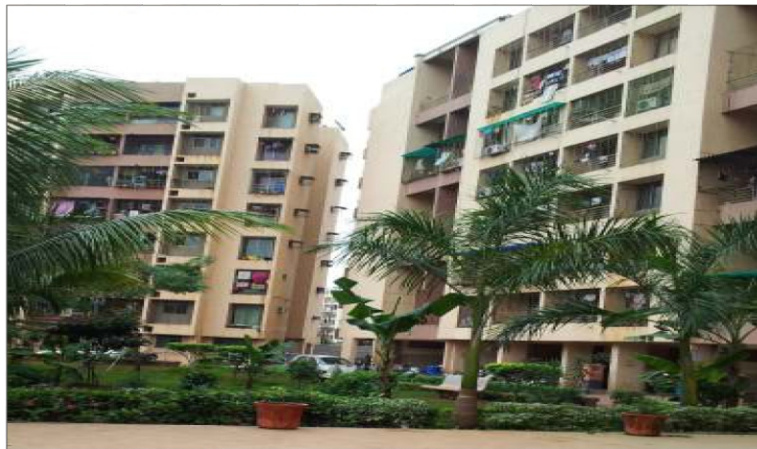
Ritu Paradise - Mira Road (E)