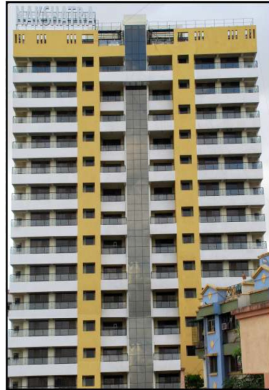
Nakshatra Tower, Mira Road (E)