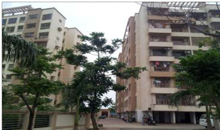
Garden Court - Bhayander (W)